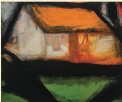
Hughie O'Donoghue (1953-) Revolution Cottage , 2015 Oil on canvas