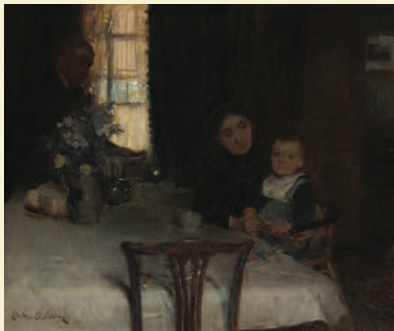
Walter Osborne (1859-1903) At the Breakfast Table , 1894 Oil on canvas