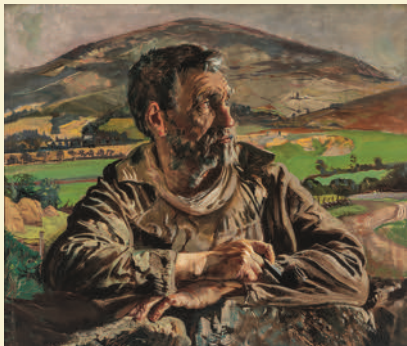
Seán Keating (1889-1977) King O'Toole , 1930