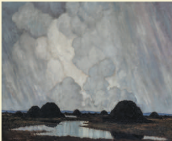
Paul Henry (1876–1958) Reflections Across the Bog , (1919-21) Oil on canvas