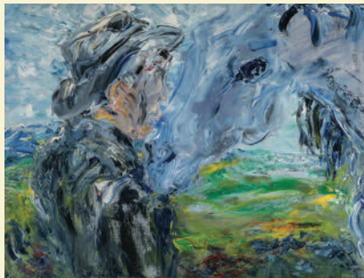
Jack B. Yeats (1871–1957) Until We Meet Again , 1949 Oil on canvas

Painting is an occupation within that art and that occupation is the freest of all the occupations of living. There is no alphabets, no grammar, no rules