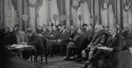
Congrès Irlandais à Paris, January 1922. (Note the signs for the various delegations from around the world.)