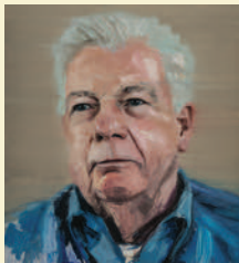
Martin Gale (1949-) Women's Work , 2000 Oil on canvas