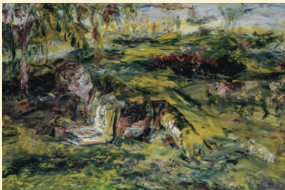
Jack B. Yeats (1871-1957) In Tir Na nÓg , 1936 Oil on canvas