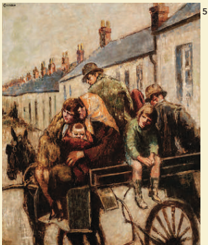
William Conor (1881-1968) The Jaunting Car , 1930s Oil on canvas

This melody recalls the novelty and jauntiness of that method of travelling.